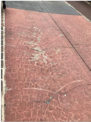
Before LussoPittura 30 years old stamped concrete