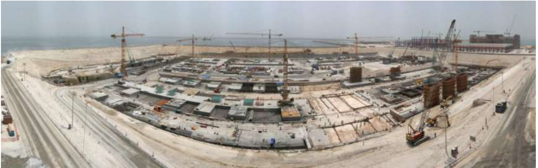
Nakhilat Ship Repair Yard