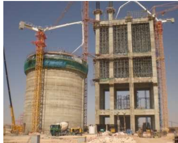
Construction of Cement Works, Umm Bab