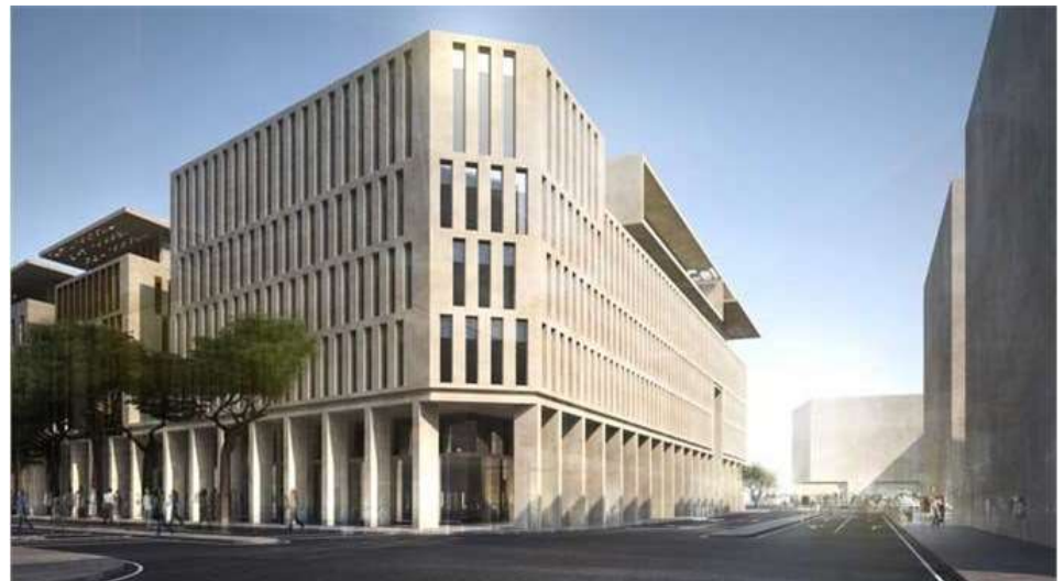
Msheireb Heart of Doha