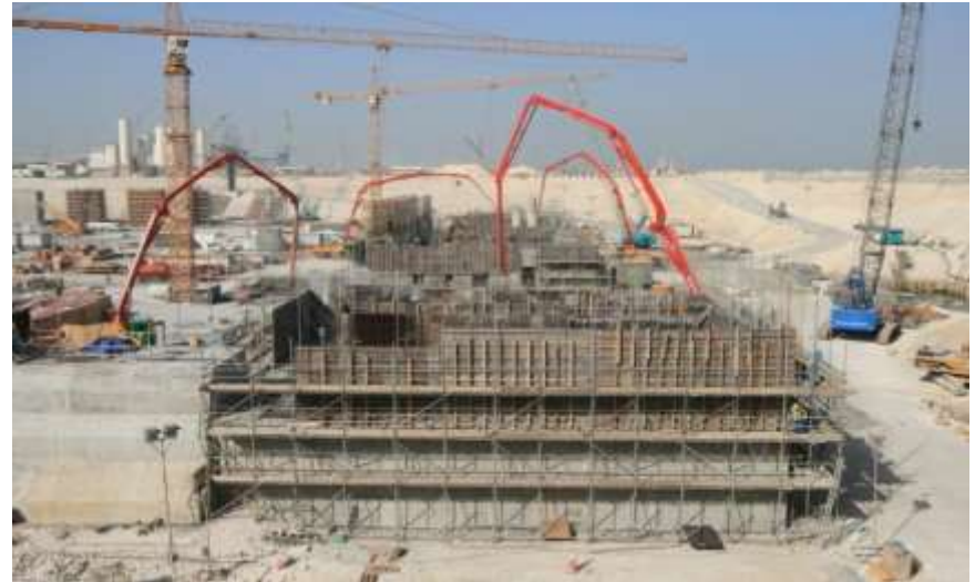
Nakhilat Ship Repair Yard, Ras Laffan Industrial City