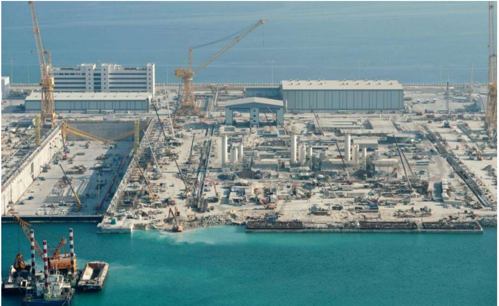
Nakhilat Ship Repair Yard , Ras Laffan Industrial City