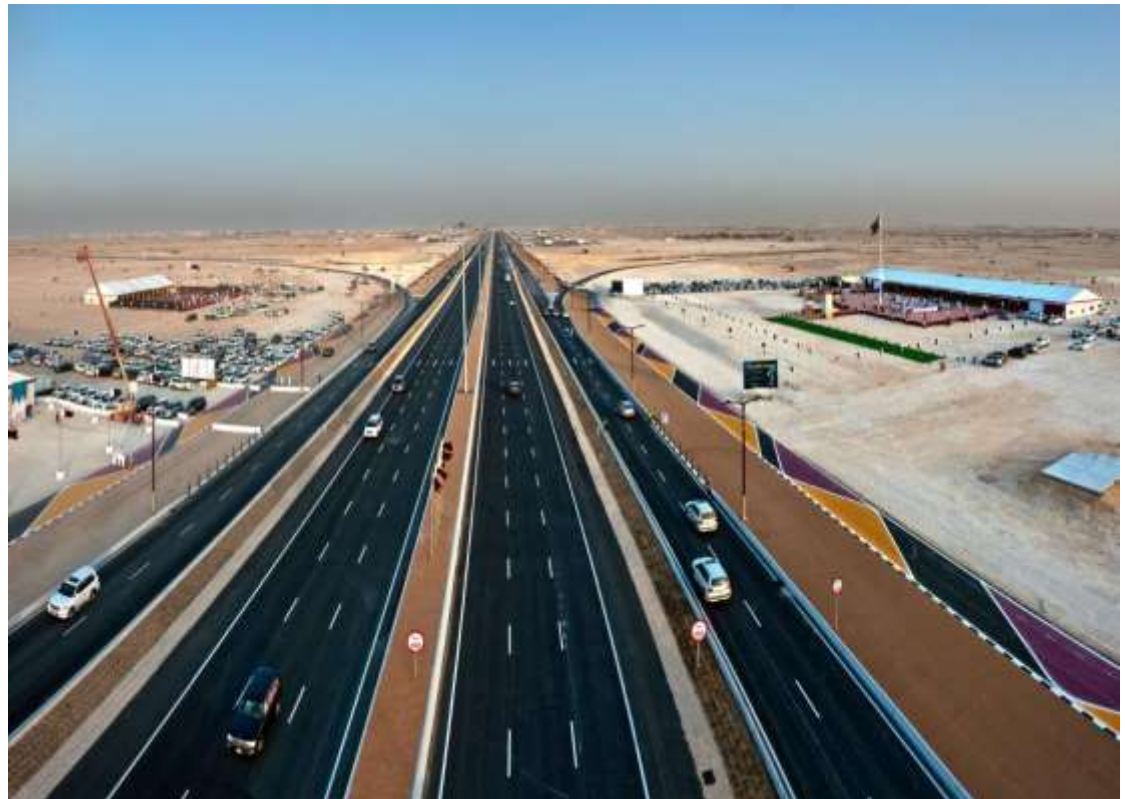
Ceremonial Road - Doha